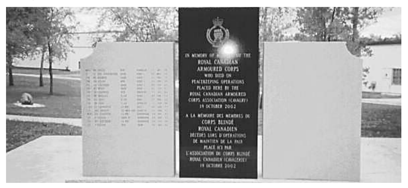
The Peacekeeper Monument in Worthington park, unveiled in 2002.