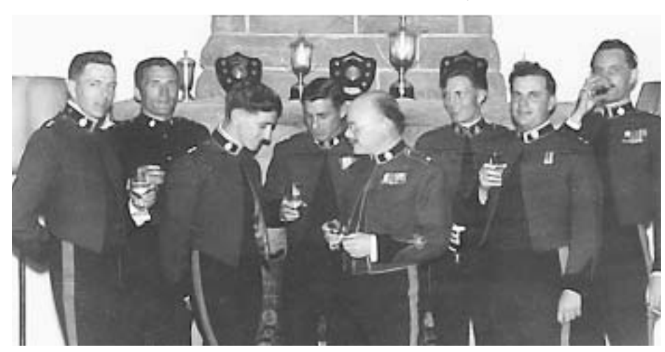
Hiding the offending fireplace.

The Lancers, stationed in Munster were directly based in line with Fort Anne , some 5-10 miles away. Their assistance was outstanding and cooperation always freely given. And, when they moved to Follingbastle , near to the Royal Tank Regiment (RTR) for deployments and training exercises, we were able to learn a great deal of armoured tactics and gunnery works. Our Short Service Commission Subalterns were beginning longer and better, for promotion, hopefully.