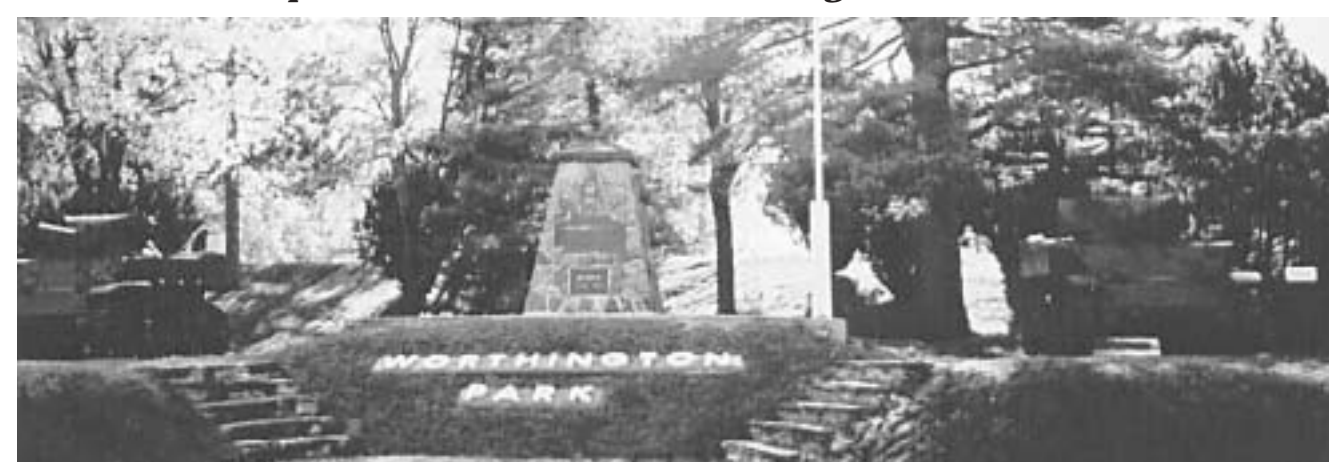
Worthington Park Borden