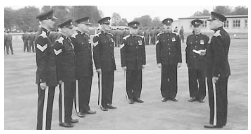
Squadron Sergeant Major at Morning Prayers.