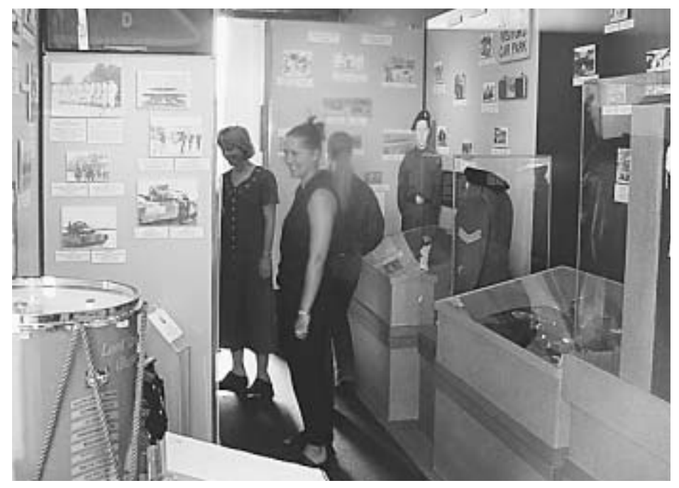
Three of the 4,825 visitors to the Museum Trailer.